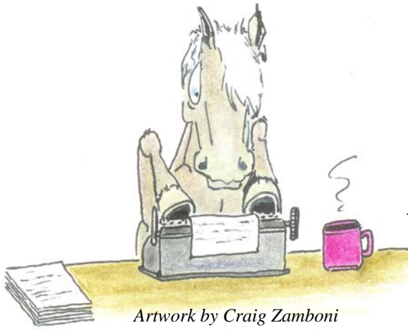
Artwork by Craig Zamboni